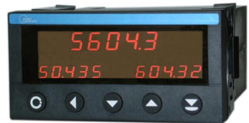
Flow Controller OC7171-3D

Flowmeters SF2000 can be directly connected to Orbit Controls digital controllers, transmitters and large remote displays. The instruments measure and display the flow rate, cumulate the totals, provide exact automatic dosing in filling machines, control set points, count batches, generate analogue signals and communicate with PCs and other intelligent controllers. The digital displays can be scaled in required flow units such as LPM or GPM. For more details consult our website www.orbitcontrols.ch