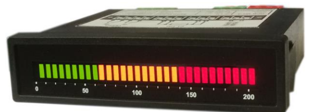
OCB301 horizontal mount